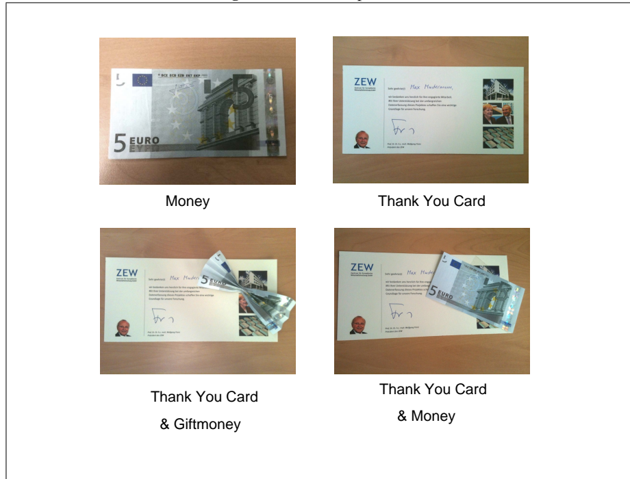
Figure 1: Gifts in Experiment 1

Note: The translation of the text on the card is: "Dear John Smith, we would like to thank you for your efforts. Your work on this project's comprehensive data entry, will create an important foundation for our research."