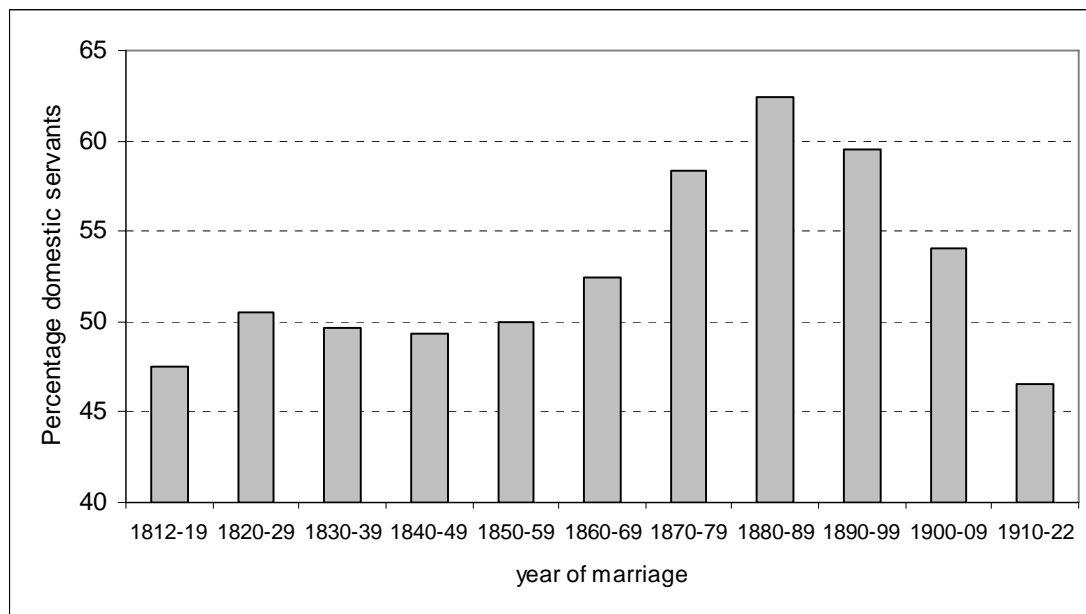
Figure 2. Percentage domestic servants among working women in the Netherlands, 1812-1922